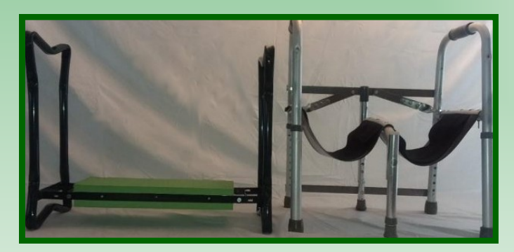
Traditional Kneeler Kneeler Plus Not Just Another Kneeler

The Kneeler Plus is a new, much better version of the traditional kneeler. It's more user friendly because you don't have to kneel completely to the floor and kneeling is painless as you cradle your knees in stretchable hammocks. Rising is effortless. It's a new kind of kneeler allowing you to remain active as you age or are confronted with knee, hip. or back pain. If you have arthritis, fibromyalgia, or sore joints this kneeler is a dream come true.